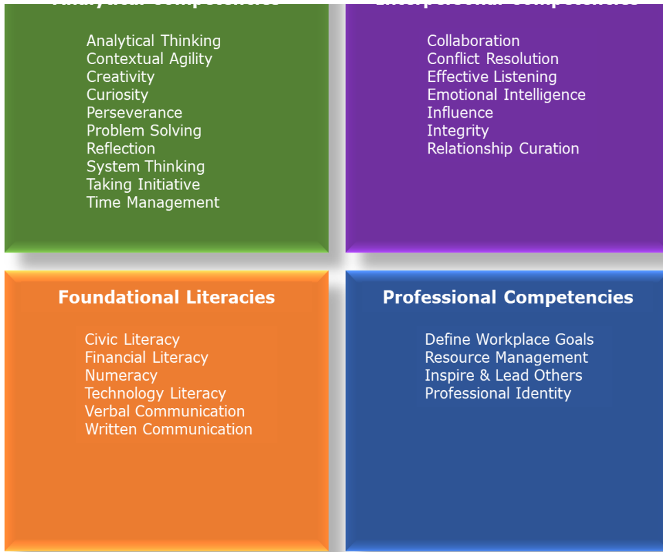
Figure-2: Four Cluster EC Model

commercial, social, and public sectors Figure-1). The first level is composed of four clusters of ECs, including analytical competencies, interpersonal competencies, foundational literacies, and professional competencies. Refer to Figure-2 and Appendix 2). The second level is composed of DSCs that will be specific to a role or organization.